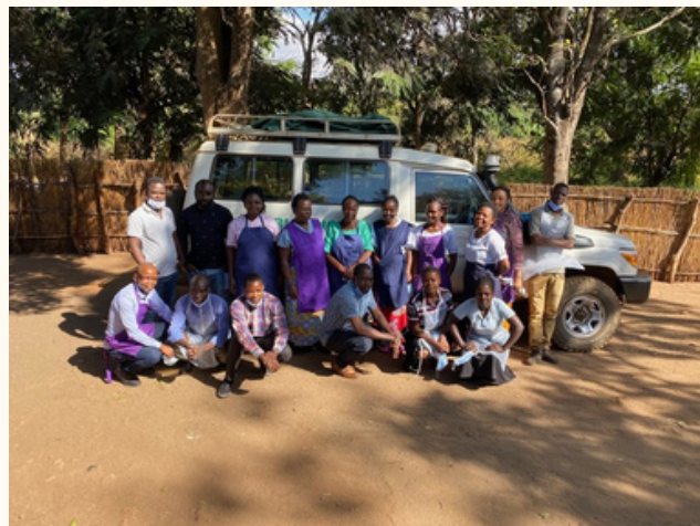
Lutheran Mobile clinic staff