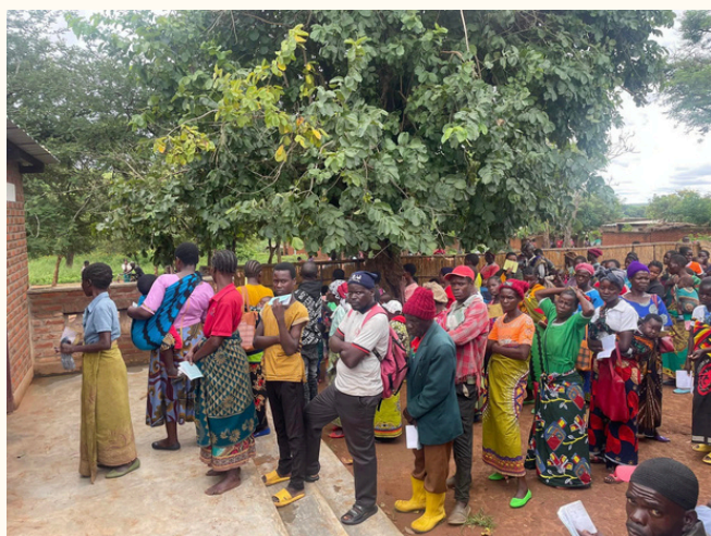
Patients waiting in line for care