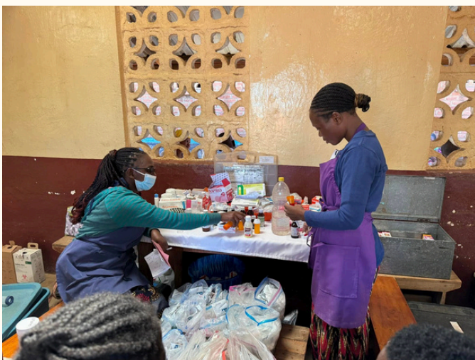
Pharmacy station at the Mwaualomwe clinic in Malawi

MONETARY Donations: Check (Payable to Central Africa Medical Mission) Mailed to WELS Gift Processing N16 W23377 Stone Ridge Drive Waukesha WI 53188