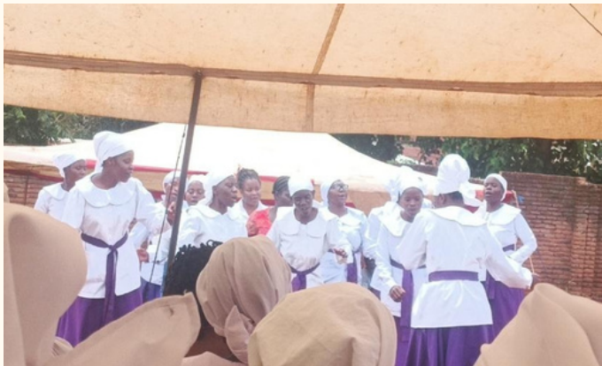
Mtendere Women’s Choir singing on Easter Sunday